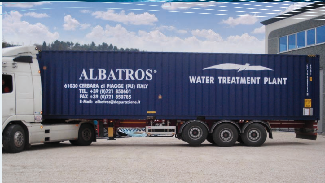
MOVABLE PURIFICATION PLANTS