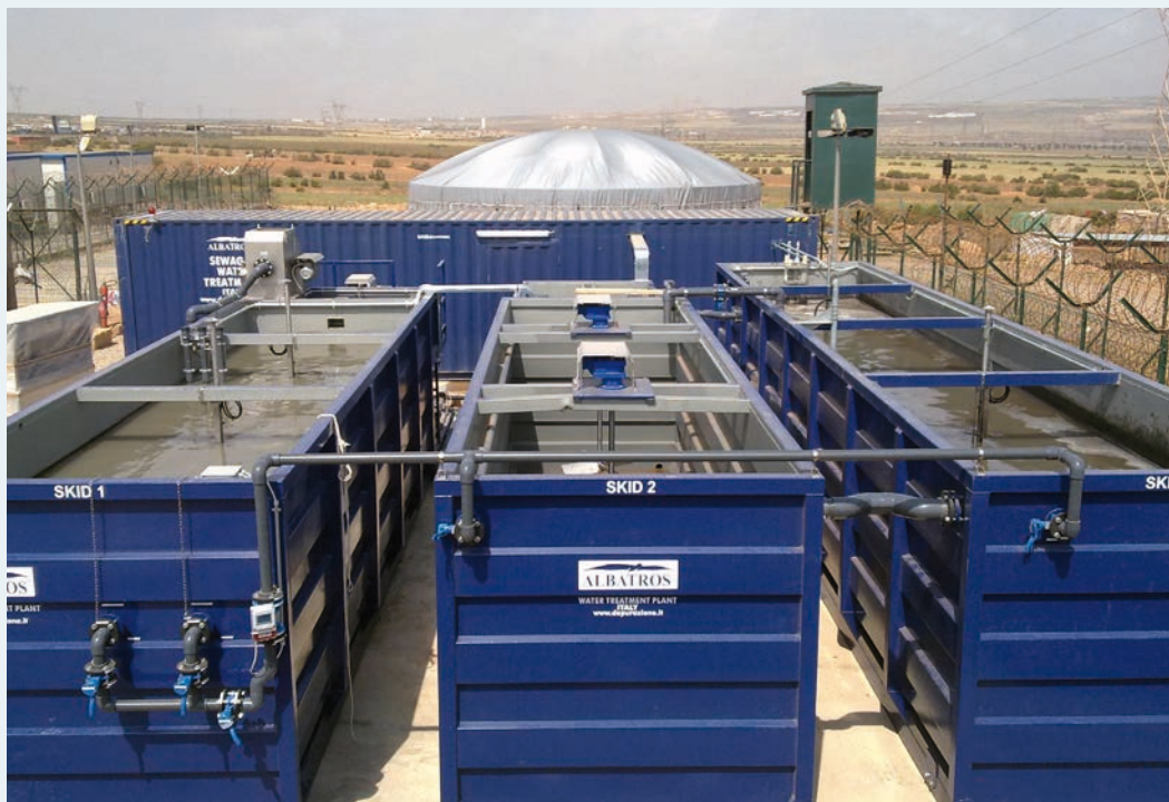
MOVABLE PLANTS FOR WASTEWATER TREATMENT