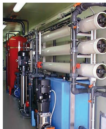
REVERSE OSMOSIS PLANT BUILT IN CONTAINER